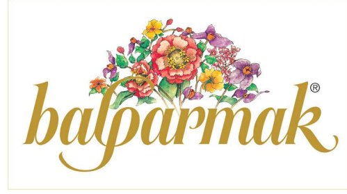
Balparmak Honey, Turkey www.balparmak.com.tr